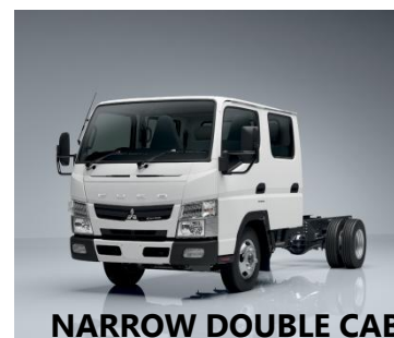
NARROW DOUBLE CAB

Wheel Type: Single piece tubeless rims Wheel Size: 5 Stud 16 x 5J - 115 Tyre Size: 195/85R15